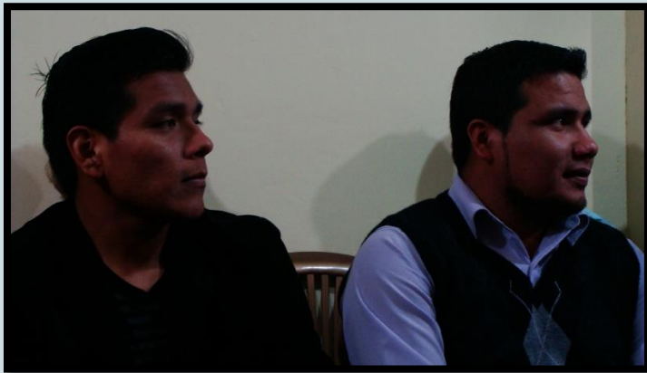
Two visiting pastors from other churches in neighboring towns.

on Friday night, there was no place to stand in the church; people stood outside to hear the message and receive the awesome flow of the Holy Spirit that night. Two young pastor who did not live nearby attended one meeting and afterward greeted us and thanked us and explained that although they were greatly blessed, they could not stay for the rest of the conference because of other commitments. We did not expect to see them again but we did. They returned again and continued to return to each meeting thereafter until the end of the conference and one of them realized God speaking in his dream even though he did not understand it when he had the dream. The other of these two pastors said, “ How have we lived without understanding what you have taught us this week? ”