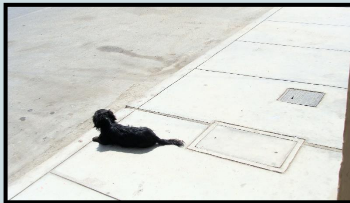
THE FAMILY DOG ATTENDS EVERY CHURCH SERVICE

Standing at the entrance of their church.