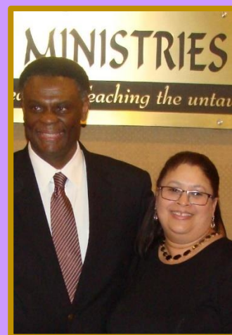
Derek Prince Ministries India