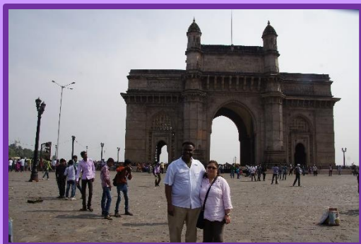
Gate of India.